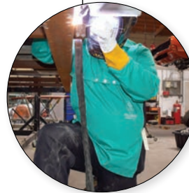
Upper torso coverage with maximum mobility