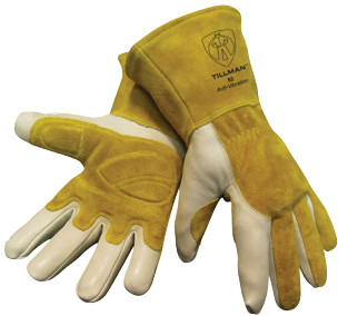
52 Cowhide Top Grain / Split