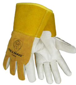
1354 Cowhide Top Grain / Split