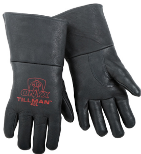
45 Pigskin Top Grain

2. The sense of touch needed for the welding gun