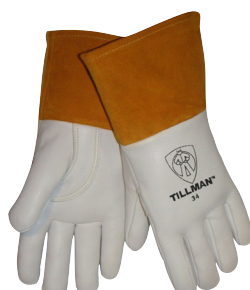
34 Cowhide Top Grain

Tillman specifically tans the leather for MIG gloves for a softer leather offering the needed dexterity for the trigger and gun operation. Finding the right balance in a MIG glove is critical for a successful weld and a great welding experience.