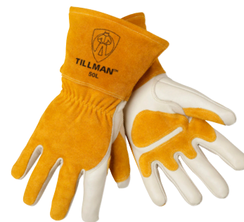
50 Cowhide Top Grain Palm Split Reinforcements