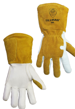
49 Goatskin Top Grain Palm / Cowhide Split