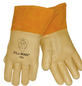
42 Pigskin Top Grain