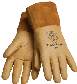
32 Pigskin Top Grain