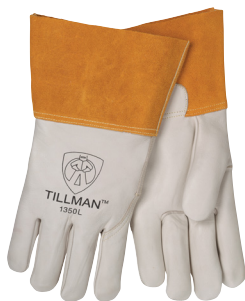
1350 Cowhide Top Grain