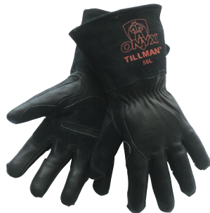
55 Cowhide Top Grain/Split