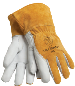
48 Goatskin Top Grain / Cowhide Split

With MIG welding creating spark and spatter, you'll want to make sure you have adequate protection above your wrist and forearm. All Tillman MIG welding gloves offer a gauntlet cuff in a range of lengths for protection above the wrist. Sometimes a cuff is just not long enough so Tillman offers both FR cotton and leather sleeves to further protect against sparks and spatter.