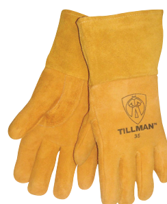
35 Deerskin Reverse Grain

Having a good sense of touch is key to executing a good weld. Different leathers offer a range of sensitivity. Goatskin and Deerskin are incredibly soft and supple with superior sensitivity. Cowhide and Pigskin are a bit thicker yet still offer good sensitivity. Sensitivity is also impacted by gloves that are either completely unlined, offer a lining on the back of the hand yet leaving the fingers unlined, or even a thicker leather.