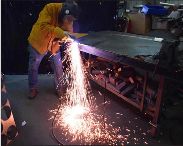
1354 MIG Glove with ANSI A2 Cut Resistance.

We are seeing more welders using MIG gloves like a multi-use glove with handling materials and welding. Tillman addressed the cut protection topic by offering different leathers with a Kevlar® lining for welding and general use. Tillman offers a few gloves with ANSI cut protection.